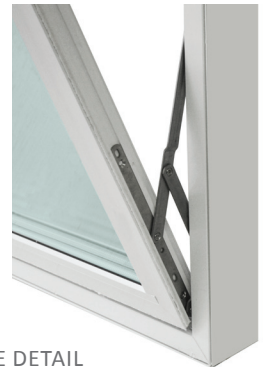
FRICTION HINGE DETAIL