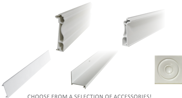
CHOOSE FROM A SELECTION OF ACCESSORIES!