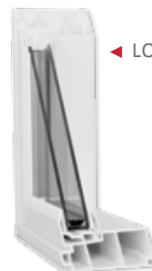
◀ LOW FIXED