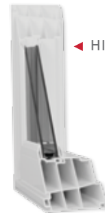
◀ HIGH FIXED